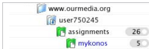
Place in: Choose Original folder hierarchy to download items to folders matching the web directory structure.

MediaPro will download all files from the Internet, and store it in the destination you defined. MediaPro will also store the file's web address in the Source URL annotation field.